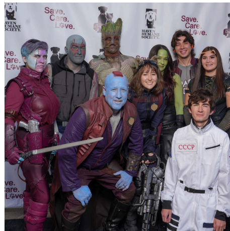
Bark, Wine & Brew (Superhero & Villain themed)