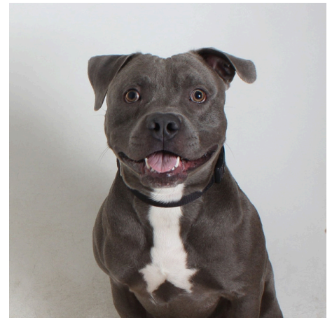
Pet of the Week Beckham

Your sponsorship provides vital support for a homeless animal and enhances your business's visibility and commitment to animal welfare. You will help shine a light on the urgent need for adoption and encourage community members to consider bringing a new furry friend into their lives. Together, we can create a positive impact in our community, leading to more animals finding forever homes. Join us in this important mission—sponsor a Pet of the Week today!