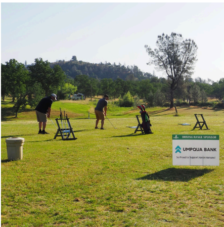
Putt 4 Paws

Sponsorships are tax deductible as allowable by law. Haven Humane Society is a not-for-profit 501(c) (3) organization, Tax ID # 94-1634752