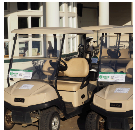
Putt 4 Paws